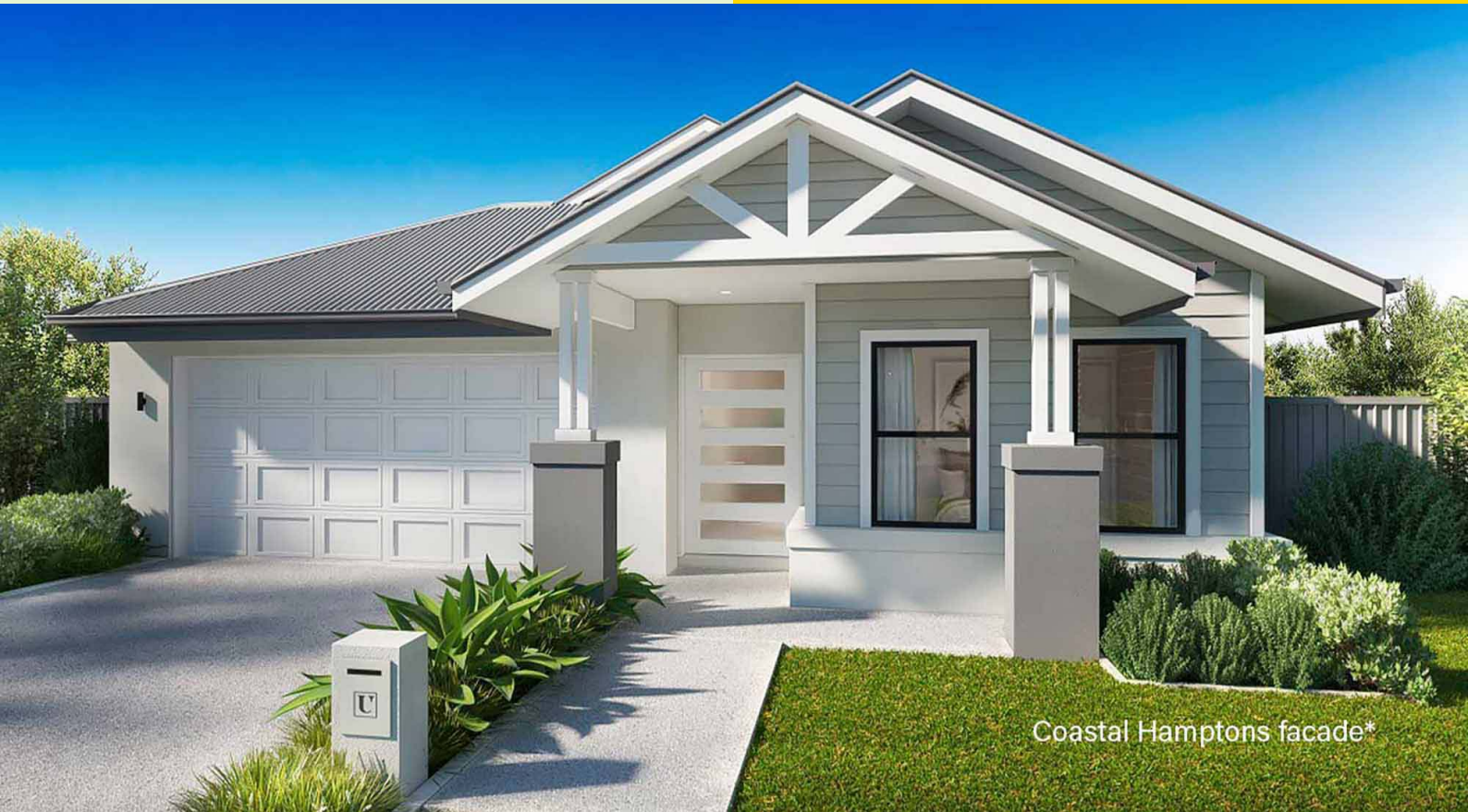
Coastal Hamptons facade*