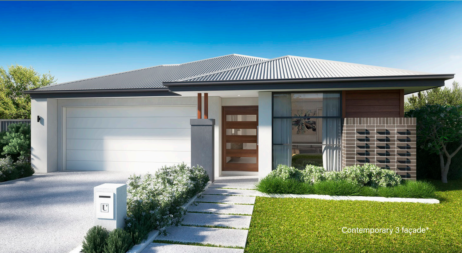
Contemporary 3 façade*