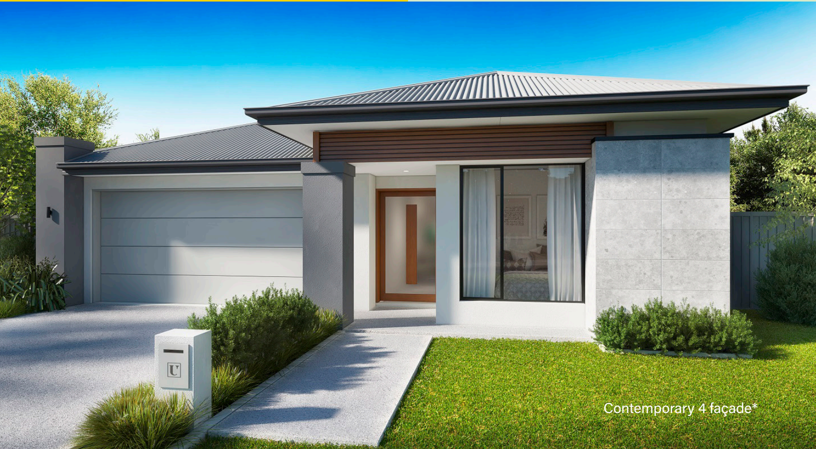
Contemporary 4 façade*